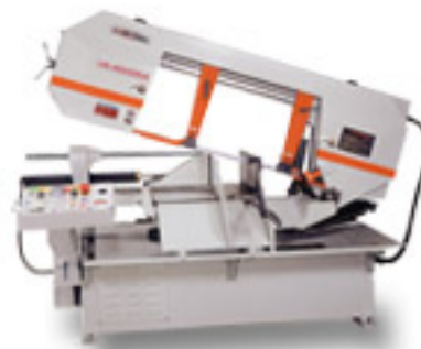
1. Saw Bow Height Auto Setting, Swiveling Saw-Bow Dual